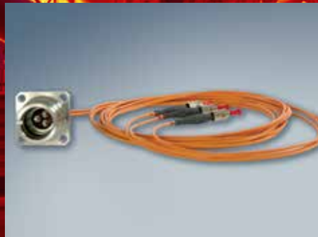
FIBER-OPTIC CABLE ASSEMBLIES

Our broad electro-optic capabilities in cable and interconnections include expanded-beam connectors that give unparalleled performance in rough and dirty environments. You'll also find an extensive line of best-of-brand, industry-standard connectors and cables in configurations to withstand any offshore hazard.