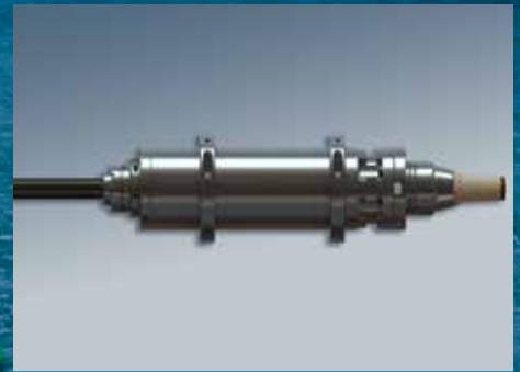
UMBILICAL POWER CONNECTORS

Our rugged downhole cables are designed to provide telemetry, control and power connectivity while withstanding elevated temperatures, high pressures and corrosive environments. Noncorrosive metal cladding and waterblocking agents ensure cables remain isolated from hazardous well gases and fluids.