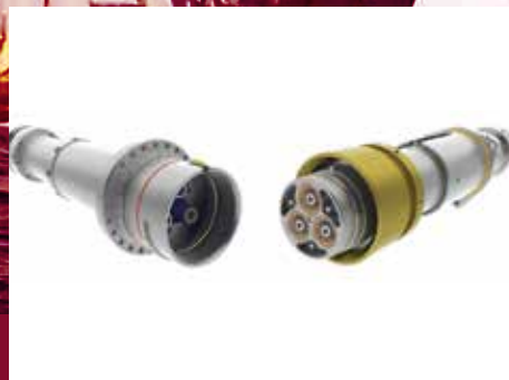
P6-MD300 SERIES CONNECTORS

Designed for seismic streamers, these dry-mateable connectors feature titanium shells and are available in 1500 V and 500 V versions for currents up to 13 A.