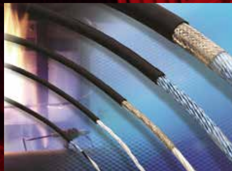
C-LITE FR CABLES