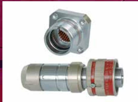
9316 SERIES CONNECTORS