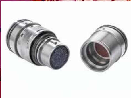
9323 SERIES CONNECTORS

Designed for seismic streamers, these dry-mateable connectors feature titanium shells and are available in 1500 V and 500 V versions for currents up to 13 A.