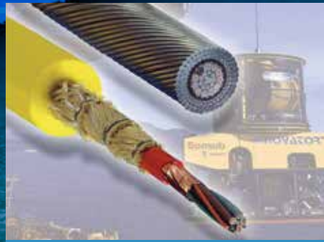
UMBILICAL AND TETHER CABLE