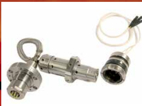
TUBING HANGER FEEDTHROUGH CONNECTORS